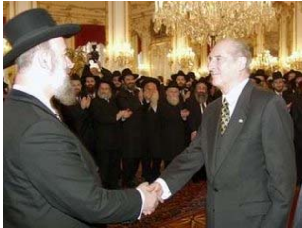
Austria - President Thomas Klestil

Rabbi Simon ben Yohai , Talmud, Minor Tractates. Soferim 15, Rule 10.